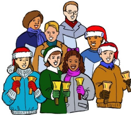
Caroling & Potluck at St. Mark's

Join Us for Carol Singing and Potluck Dinner on Saturday January 4, 2025 5:00 pm